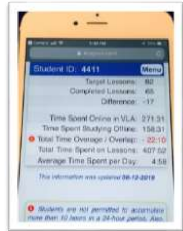
Attendance Data Screen

* Attendance data is typically updated once per week, on Monday afternoon or Tuesday morning.